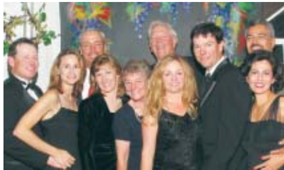
Happy Holidays from the Wildhurst Family!

A warm toast. Good company. A fine wine. May you enjoy all three.